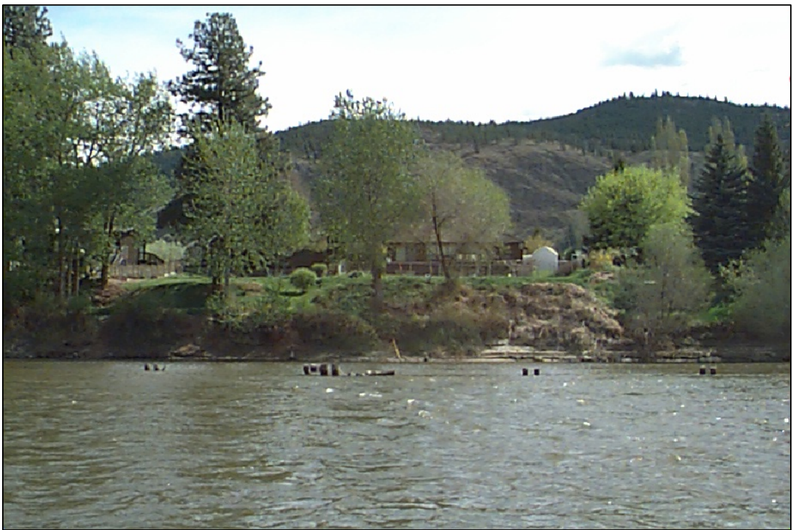
LEFT BANK VIEW