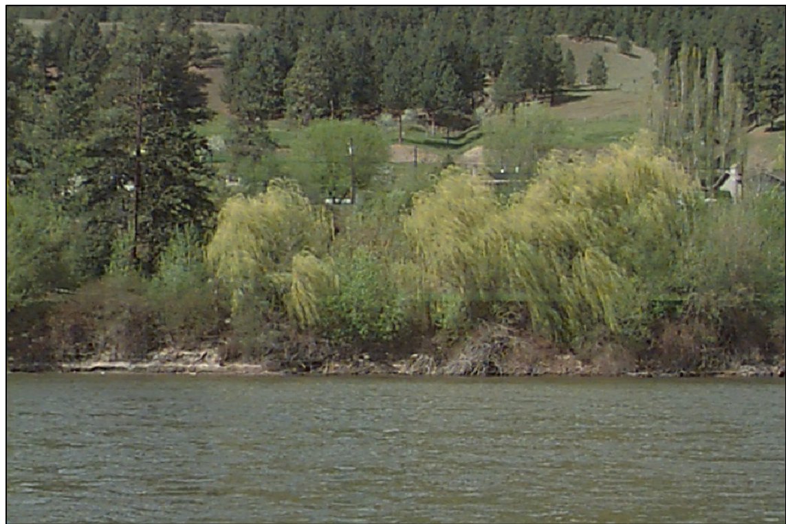
RIGHT BANK VIEW